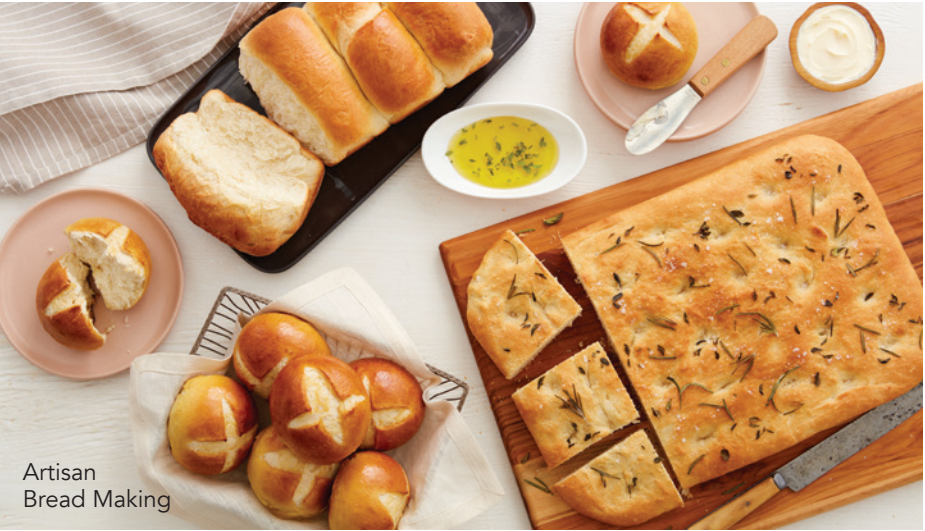
Artisan Bread Making