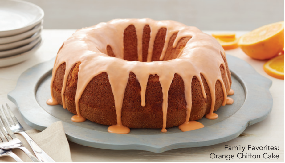
Family Favorites: Orange Chiffon Cake