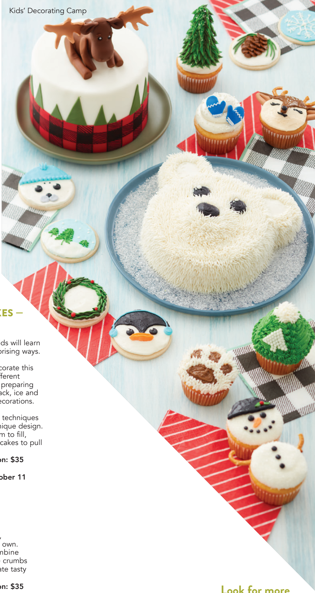
Kids' Decorating Camp

Tuition: $50 Registration: $35 Dates: June 25, August 4 Time: 10 am – 3 pm