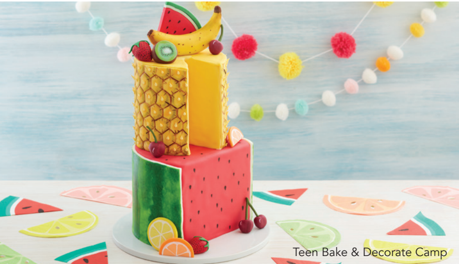
Teen Bake & Decorate Camp