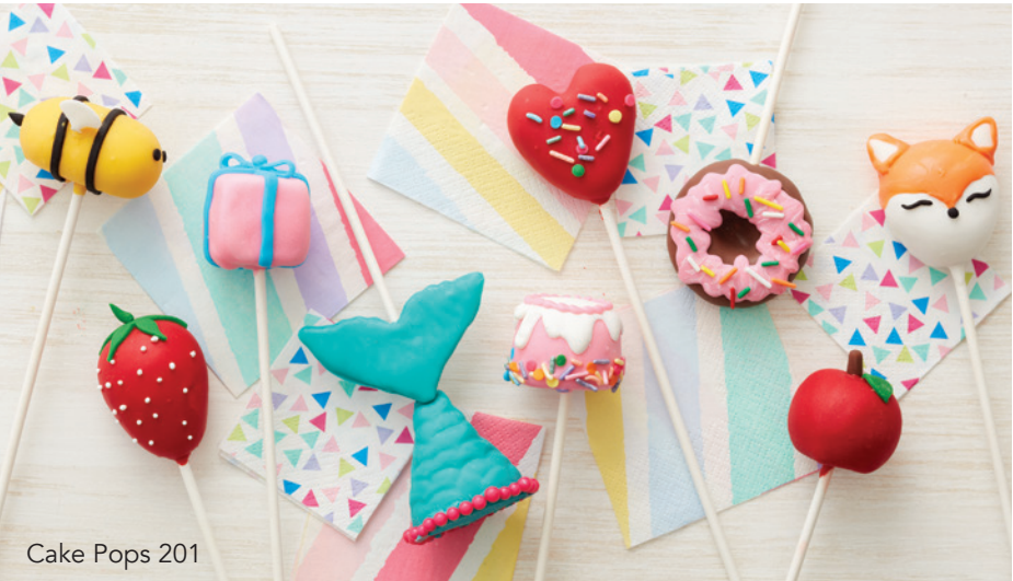
Cake Pops 201