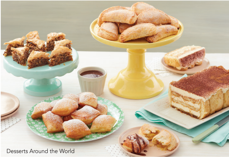
Desserts Around the World

In this class, students will learn how to bake from scratch. We will teach you how to properly measure and mix ingredients, prepare the pans, bake, cool and decorate—from start to finish!