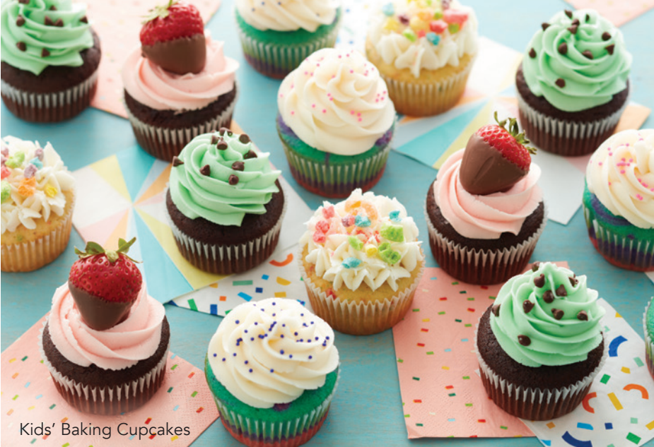
Kids' Baking Cupcakes