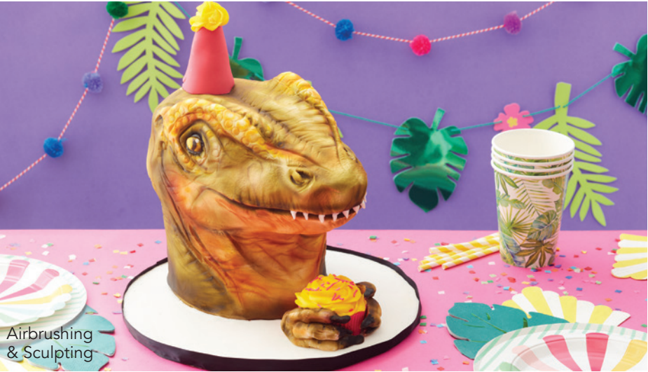
Airbrushing & Sculpting

The 201 series offers specialty classes where you'll learn advanced techniques to continue building upon your skills and expanding your knowledge of cake decorating.