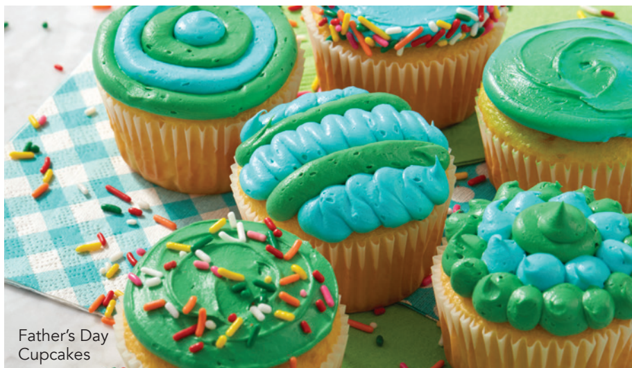
Father's Day Cupcakes