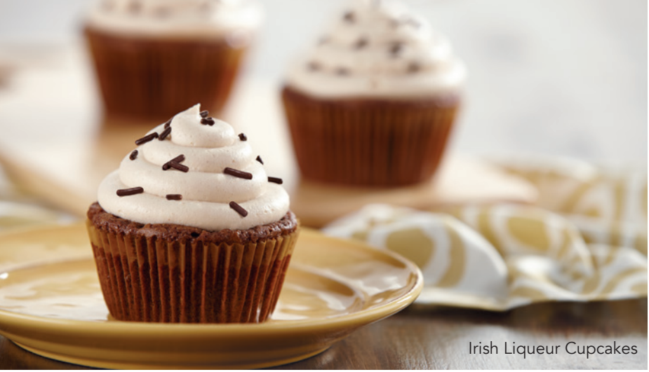
Irish Liqueur Cupcakes