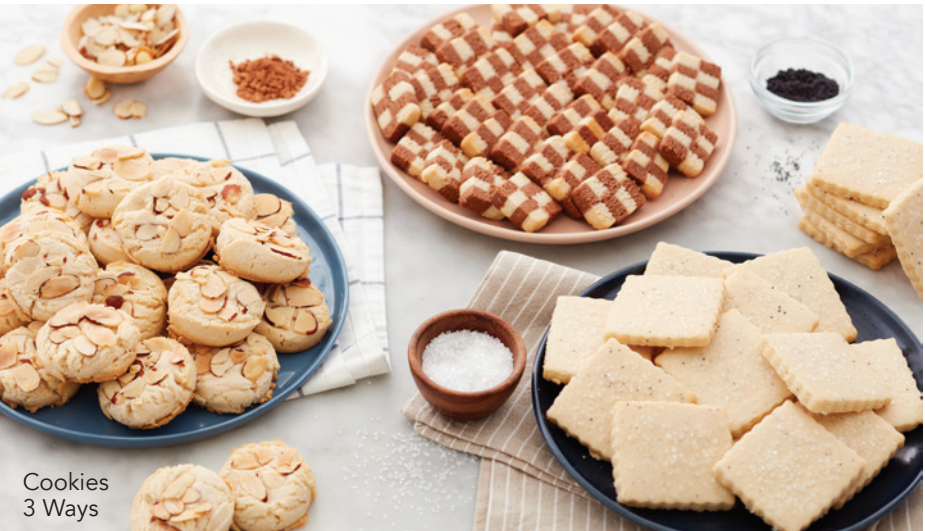
Cookies 3 Ways