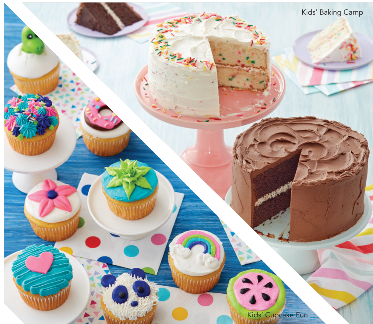
Kids' Cupcake Fun