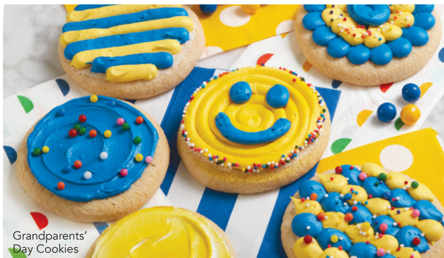
Grandparents' Day Cookies

Kids (ages 5 - 10) and adults can spend some quality time together learning how to decorate for special occasions and that special someone.