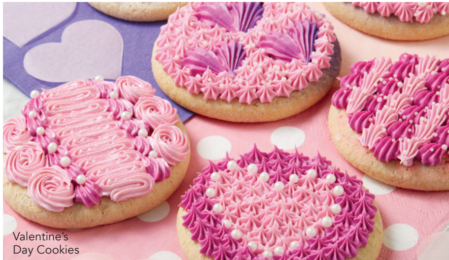
Valentine's Day Cookies

Spend time together learning how to decorate treats for a special occasion and that special someone. Families will have fun as they learn some new tricks for creating special treats.