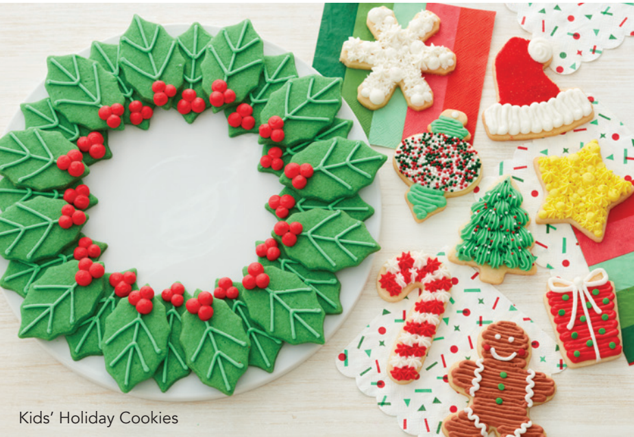
Kids' Holiday Cookies