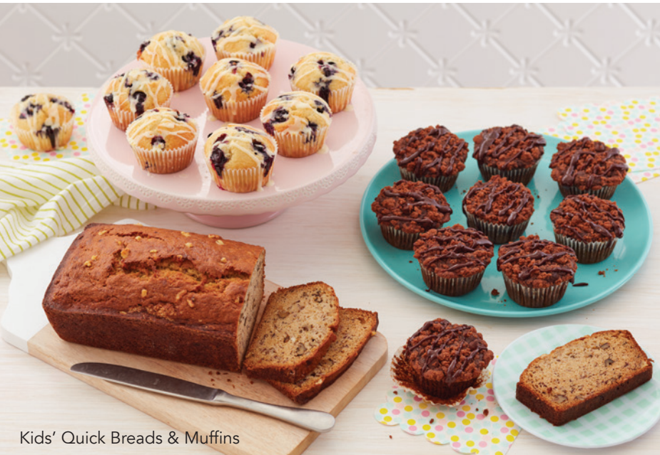
Kids' Quick Breads & Muffins