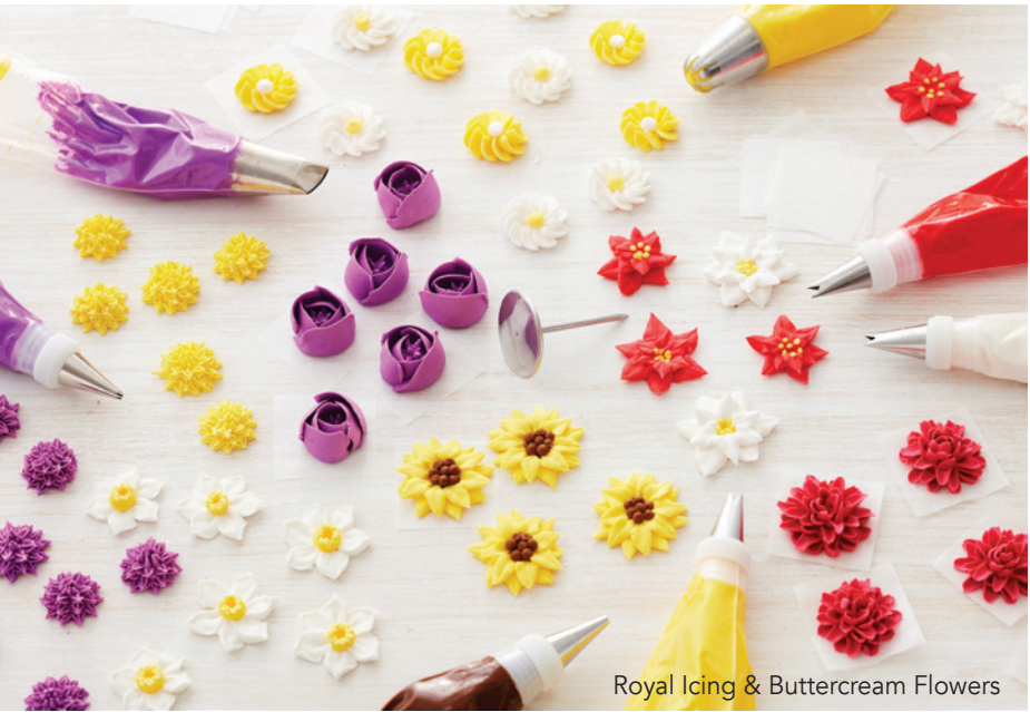
Royal Icing & Buttercream Flowers