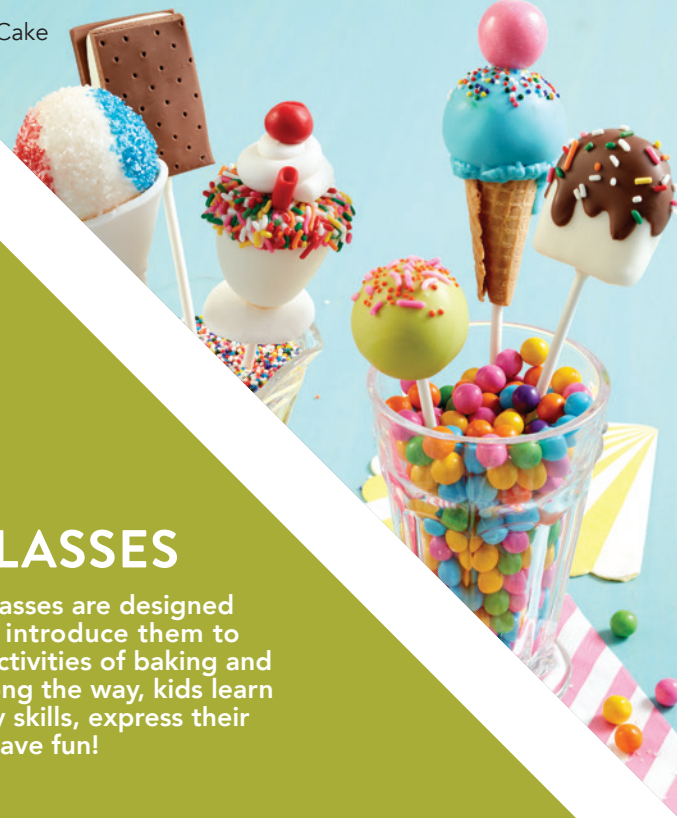
Kids' Cake Pops